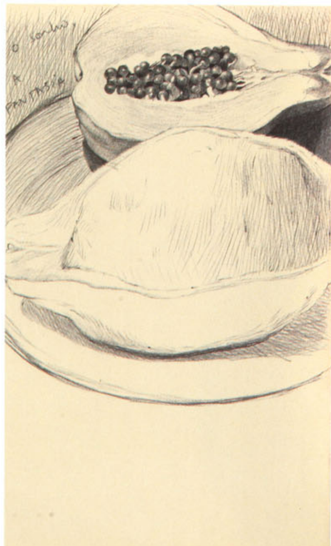
SEM TÍTULO 1997 21x12,5cm